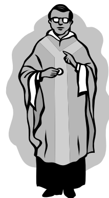
25 Years of Ordination

For 2012 Development and Peace will be focusing on the theme of Ecological Justice, illuminating the inter-connection and interdependence of all the Earth community. Both now and in the future we strive to create healthy human communities which can feed themselves while also maintaining healthy ecosystems. Look for more information about this topic in future church bulletins.